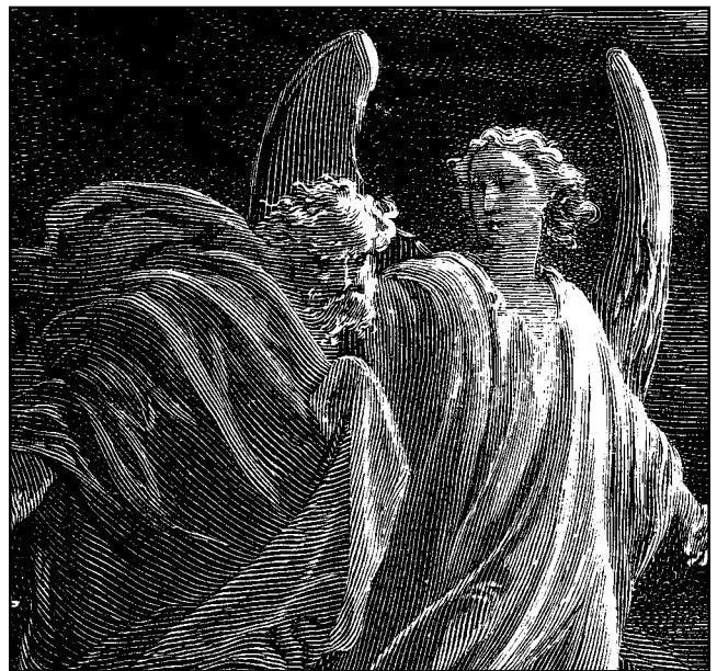
Peter, who wrote to those at Babylon, being freed from Prison.

The three words “church that is” are italicized in the King James Version, showing they are supplied by the translators and lack a Greek equivalent in the manuscripts. The article is in the feminine and thus many translators render this phrase, “ she who is in Babylon.” The debate focuses on whether a specific sister is referenced or whether it is the collective church that sends their greetings.