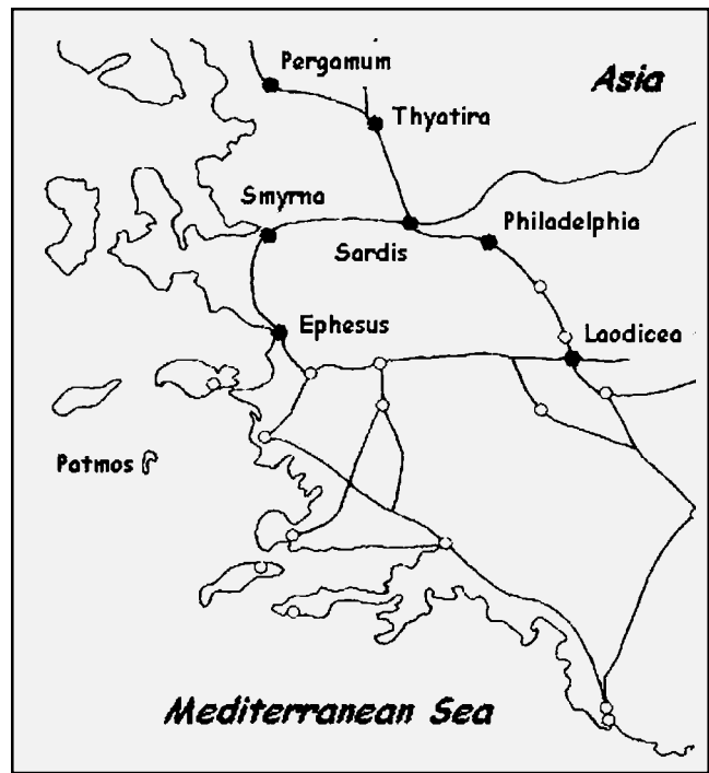
Sardis, a City of Asia Minor

There is another indication given in the letter to show what is meant by spiritual death overtaking the Church of Sardis, namely, the few who did not share in the general deterioration. They are described in verse four as "people who have not soiled [defiled] their garments." Sin had crept into the church, less openly than in the case of Jezebel at Thyatira, but the piercing eyes of Christ did not miss its defiling influence. According to Herodotus (the historian), the people of Sardis, over many years, had acquired a reputation for lax moral standards and even open licentiousness. 3 Perhaps the church at Sardis had forgotten Paul's exhortation, "Do not be conformed to this world," or John's, "Do not love the world or the things in the world." It may be that gradually, even imperceptibly, the leaven of wickedness and