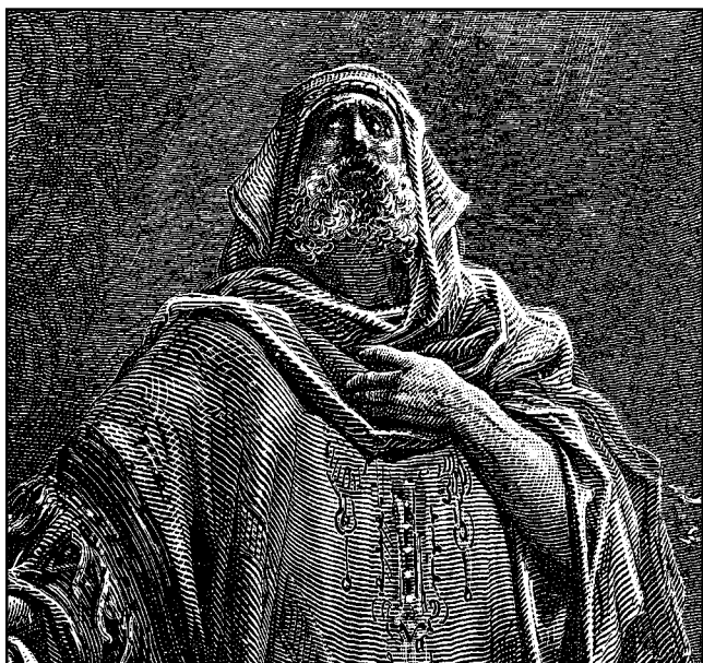
Jeremiah, whose prophecies speak of eagles.

The raven and a few other birds are known to be swift and adept in shorter flight and movement. In fact, the raven often annoys the eagle in the air. The eagle's lack of maneuverability under certain circumstances constitutes a relative weakness. However, its swiftness of flight is recognized and used in the Bible, where we read expressions like "as swift as the eagle flieth," "as the eagle that hasteth to the prey," and, "as the eagle that hasteth to eat" (Deuteronomy 28:49, Job 9:26, Habbakuk 1:8). These expressions are used to vividly impress such lessons as the remarkably swift invasions into the Holy Land by some of Israel's enemies, notably King Nebuchadnezzar of Babylon. And the eagle was the emblem or ensign used by the renowned and feared legions of ancient Rome in the days of their glory and power. As a symbol, the eagle impressed enemies with the swift-