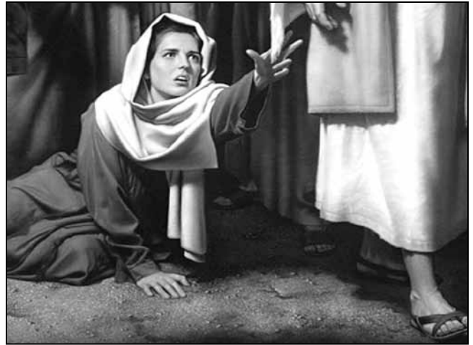
Reaching for the Hem of his Garment, after 12 Years of Distress