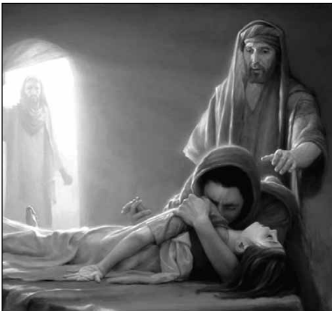
Jairus' Daughter, Died and Raised at Age 12

The 18 persons who died at the Tower of Siloam, through no fault of their own, represent the world of mankind, subjected to the curse of sin and death through inheritance. The woman bowed over with infirmity, “whom Satan hath bound,” through no fault of her own, also represents the world, bowed under the burden of sin.