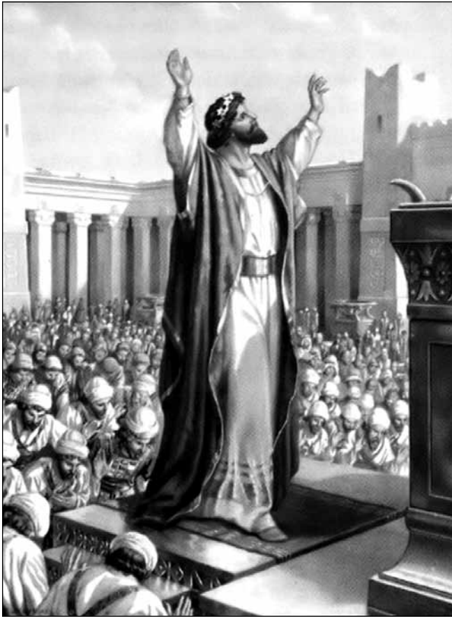
Solomon's Prayer at the Dedication of the Temple

and judgment are the habitation of his throne. A fire goeth before him, and burneth up his enemies round about.”