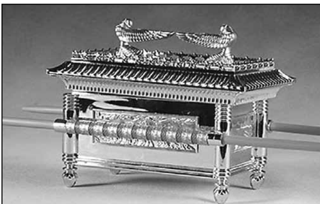
Model of the Ark of the Covenant

Our hope is for a spiritual resurrection, a resurrection to the divine nature with immortal and incorruptible spiritual bodies. This picture of the sealskin shows that the flesh