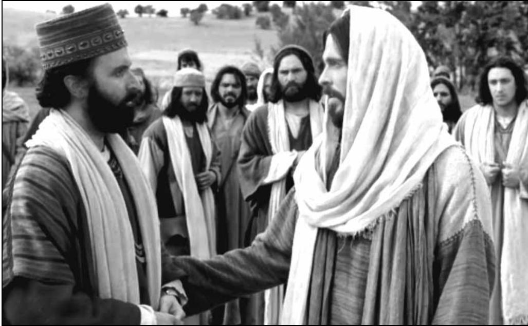
The Rich Young Ruler — The Price was Too Dear

an unreasonable question, it showed a measure of selfish desire, spoken by a natural man.