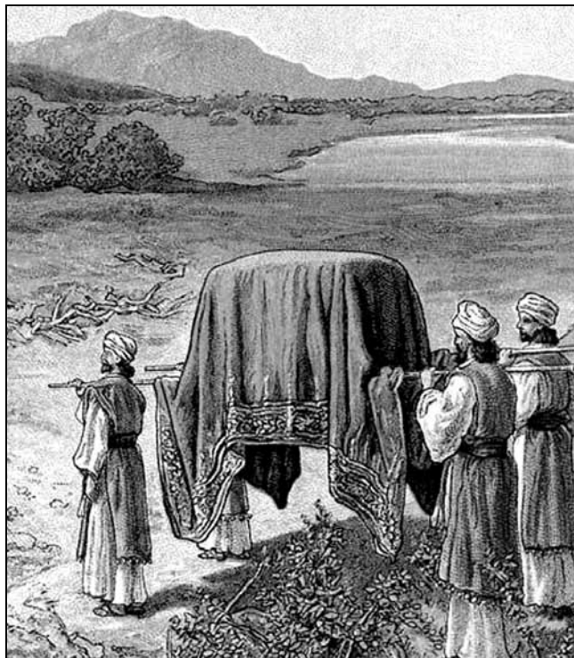
The Ark of the Covenant, with Blue Outer Covering

The veil, which was hung between the Holy and the Most Holy, represents the sacrificial death of the flesh. In the book of Hebrews this veil is actually mentioned