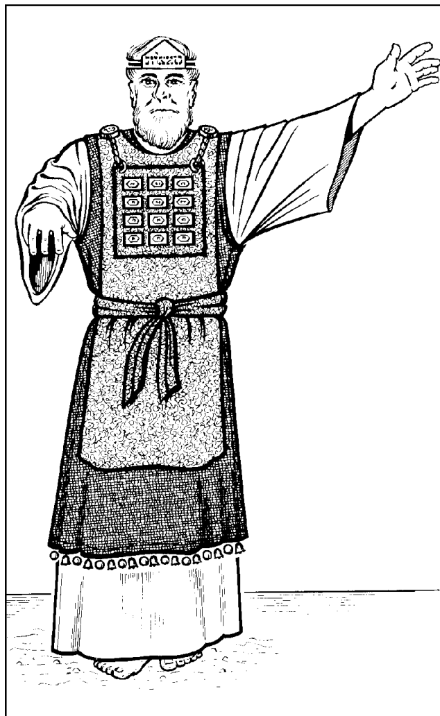
The High Priest in Robes of Glory and Beauty

These texts imply that restored Israel will have the Millennial age responsibilities of assisting man in their worship, teaching them the laws and regulations of that kingdom, and leading them in songs of eternal praise to Jehovah