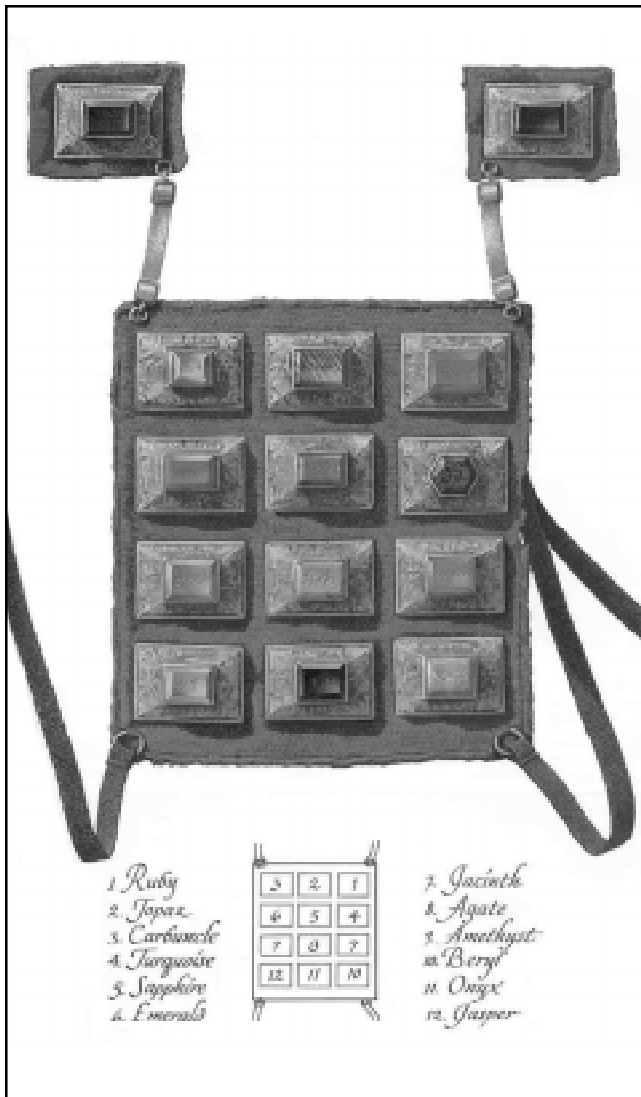
Traditional representation of Aaron's breastplate. The Bible does not record the order of the names to be inscribed on the stones, so that identification of a tribe with a certain stone is guesswork.