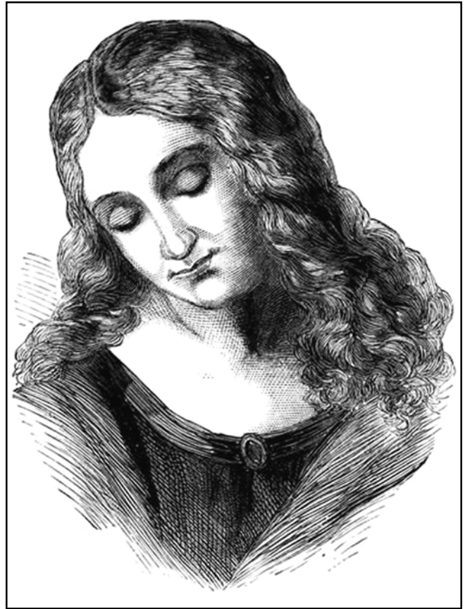
John the Apostle, who later received a vision of New Jerusalem

For the book here mentioned, wherein the captivated Jews as many as shall be delivered are written, is the book of life