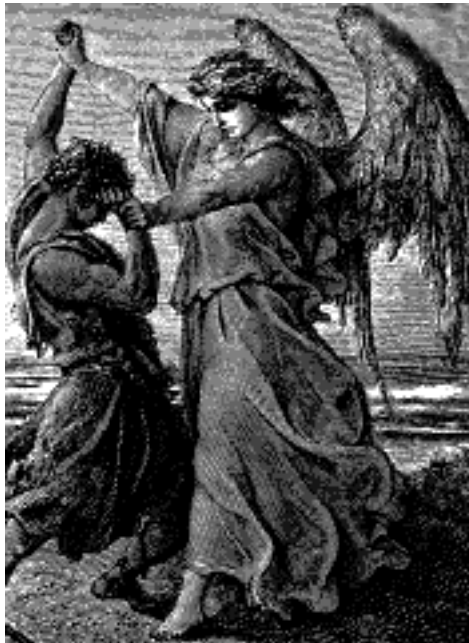
Jacob Wrestling with the Angel

Jacob begins his struggle believing he is wrestling with a human foe, and schemes accordingly. But sooner or later he recognizes in himself the chief opponent, for he realizes he is fighting God . This moment of truth brings a great loss of confidence, for at the Lord's touch he becomes weak as a little child . Now all he can do is cling to his opponent. He no longer resists. Now he is wrestling in prayer, and will not let go until he has the blessing of God he longs for... and we are watching it now!