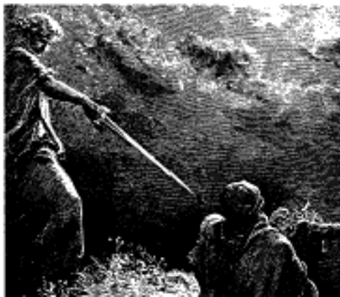
The Angel Appearing to Balaam

The American Standard and other reliable translations use "sons of tumult" in place of "sons of Sheth" in verse seventeen, translating the Hebrew word instead of making it a proper noun. For this reason Maimonides interprets the text as Messiah having dominion from "sea to sea."