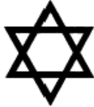
The Star of David

The star of David is composed of two interlocking triangles. The triangle has long been identified with strength, and is therefore used architecturally in trusses. David joined the southern and northern kingdoms, represented by facing triangles, and produced the "star of David." Note that the resulting shape has 12 exterior surfaces, one for each of the tribes of Israel.