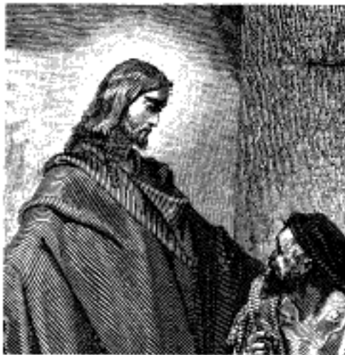
Jesus, the Forgiving One

We are actually more concerned with Benjamin than with Simeon. After all, Benjamin is our brother in Christ. Why would antitypical Joseph plant his silver cup in Benjamin's bag to bring such distress upon him and all the natural Israelites? Remember when Joseph saw his brother Benjamin, his soul yearned for him and he had to leave the room to seek a place to weep. ( Genesis 43:30 ) He thereafter gave five portions to Benjamin his brother! He seemed extravagantly pleased with Benjamin. Then he places his silver cup in Benjamin's bag, making him look like a thief. None of this seems to add up. Benjamin was not really in danger of literally being a slave to Joseph, was he? Joseph surely would not allow any harm to come to his brother whom he loved. Joseph knew that his brothers had brought Benjamin to them under great restraint from his father Jacob. Certainly Joseph was not going to do anything to give his father further pain. This silver cup was planted on Benjamin to test his brothers. What would they do if it looked like harm were to befall Benjamin?