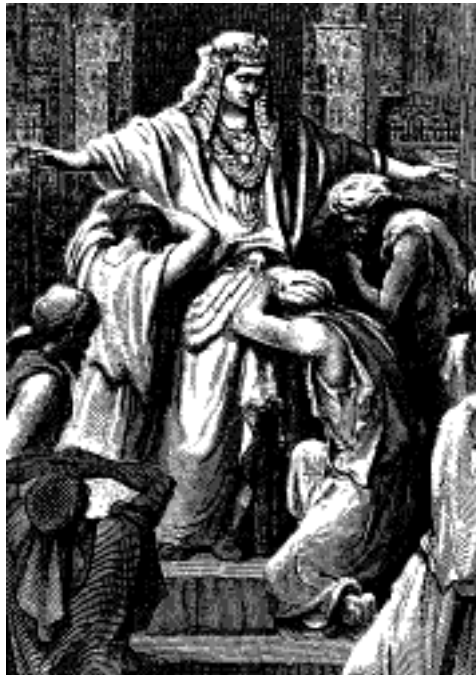
Joseph Blessing His Brethren

The Jews who have become a part of Babylon will find themselves in extra hardship when it collapses. They will be bound in that system incurring God's judgment. They may indeed picture Simeon in our time. Yes, the Simeon class is bound in Christendom while his brothers are back in their homeland feeding their families and Jacob. The nine brothers are sent home with the proviso that they bring Benjamin back with them.