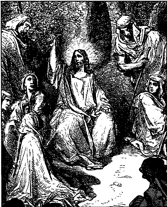
The Sermon on the Mount

By its very nature hate destroys and tears down; by its very nature love creates and builds up. Love transforms with redemptive power.