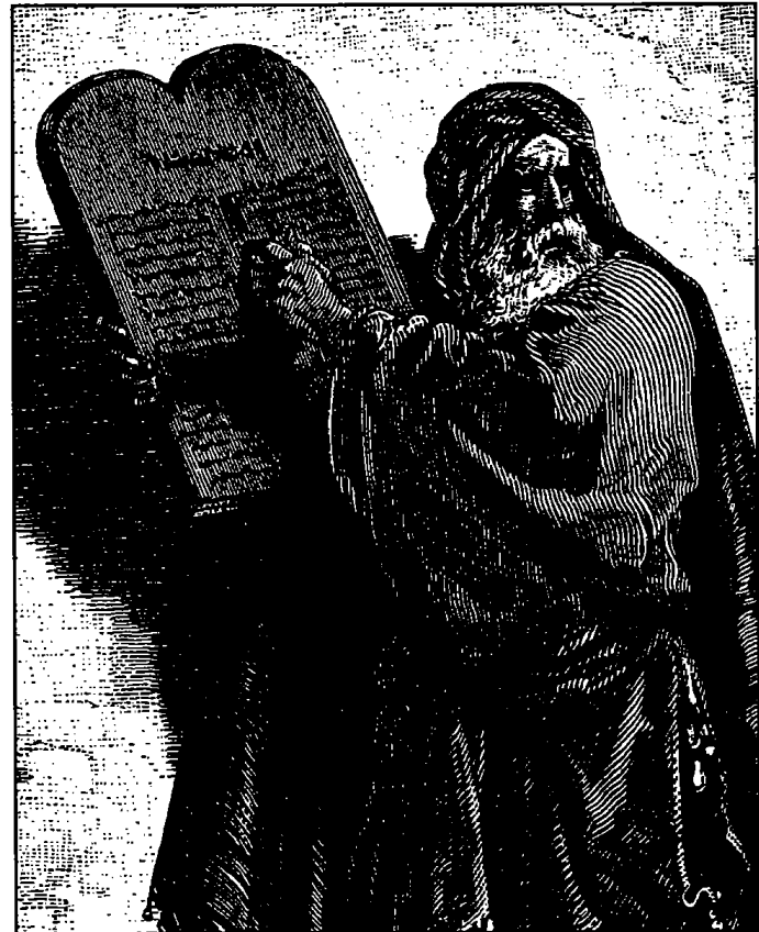
Ezra, who Refurbished the Temple

There is a larger picture as well. The temple represents the Church. "Know ye not that ye are the temple of God, and that the Spirit of God dwelleth in you?" (1 Corinthians 3:16). "Ye also, as lively stones, are built up a spiritual house"