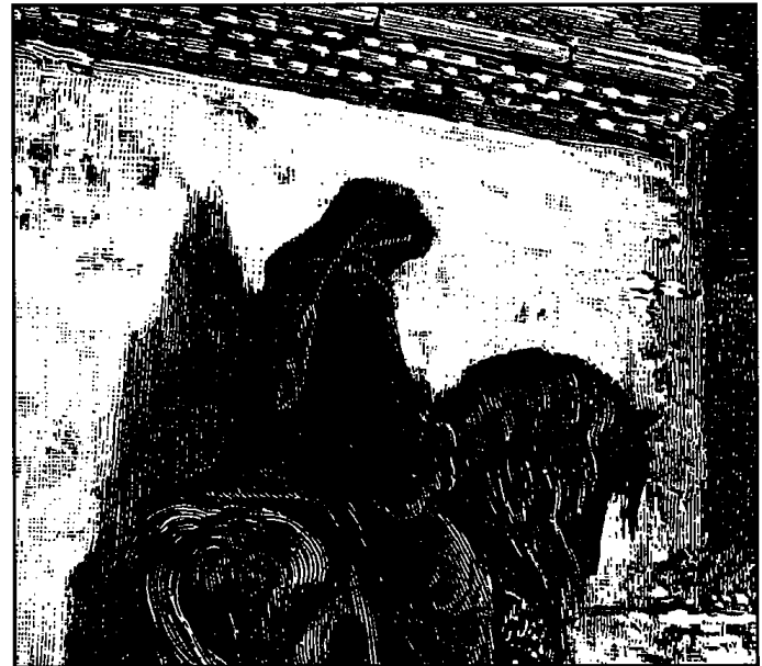
Nehemiah Secretly Assessing the Walls

The narrative of Ezra's return is found in Ezra chapter seven. By his time the temple had fallen into some disrepair and he accomplished a refurbishing of the temple and reinvigoration of its services and offerings. What might this rep-