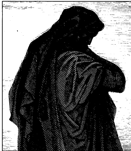
Ezekiel the Prophet

About eight hundred years before Christ the nations of the Middle East - Assyria, Babylon, Elam, Media, Syria, and Israel - became dimly conscious of a new threat to their political interests. A number of strange, warlike and barbarous peoples, hitherto unknown, had appeared in the northern countries of Lydia and Armenia, raiding, killing and taking possession. Within a century they had reached the frontiers of Assyria; the celebrated Sennacherib, and later his son Esarhaddon, led the Assyrian armies against them and with some difficulty forced them back. In the Assyrian historical inscriptions the invaders were called the Mushku, the Tabalu, the Gimirrai and the Til-garimmu; the corresponding Bible names are Meshech, Tubal, Gomer and the House of Togarmah. Meshech and Tubal were Scythian tribes first known in history in what is now southern Russia between the Black Sea and the Caspian, where Tiglath-Pileser I of Assyria fought them in the 12th century BC.