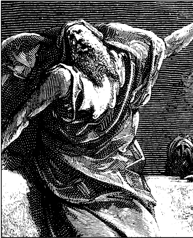
The Prophet Jeremiah

struct would suffer persecution at the hands of his own people, as the prophets declared the Lord's message. In this instance Jeremiah had to purchase and actually wear this linen girdle until it began to rot and become nearly unbearable to him. He had to wear it on the long journey to the Euphrates River, where he buried it in a rock or most likely in a cave near the river.