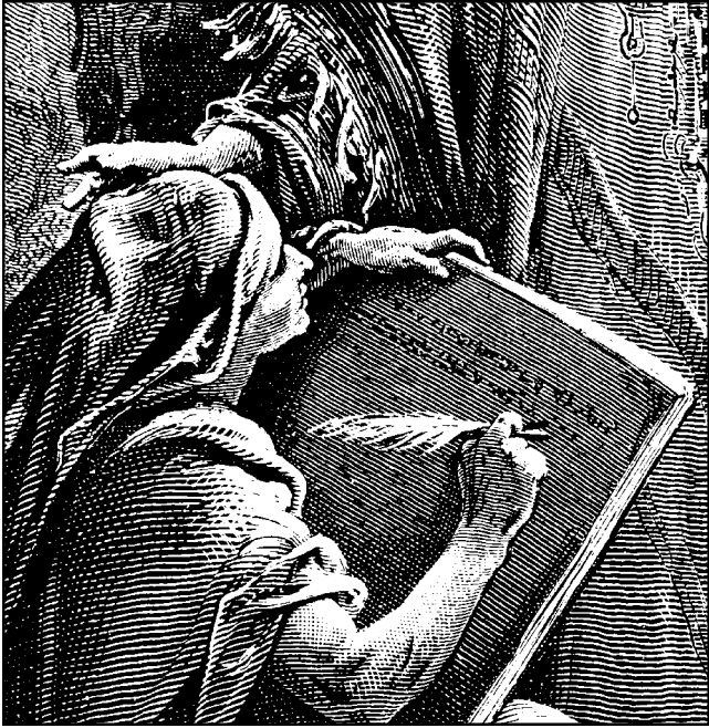
Baruch Writing Jeremiah's Prophecies

say unto thee, Do we not certainly know that every bottle shall be filled with wine? Then shalt thou say unto them, Thus saith the LORD, Behold, I will fill all the inhabitants of this land, even the kings that sit upon David's throne, and the priests, and the prophets, and all the inhabitants of Jerusalem, with drunkenness. And I will dash them one against another, even the fathers and the sons together, saith the LORD: I will not pity, nor spare, nor have mercy, but destroy them."