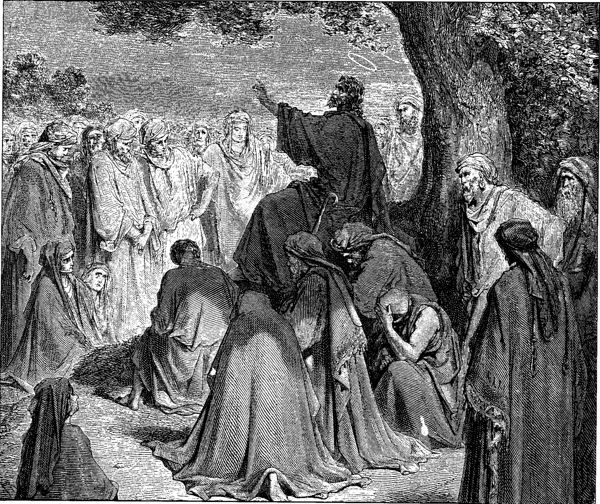
Jesus Preaching to the Multitudes

In the first we understand he represents himself as planning the building of a vast structure - a tower, or stronghold. Elsewhere he has stated his intention - "I will build my church, and the gates of hell shall not prevail against it" (Matthew 16:18). At the time he speaks he is himself engaged in laying the foundation, by the sacrifice of himself as the ransom price. "For other foundation can no man lay than that is laid, which is Jesus Christ" (1 Corinthians 3:11).