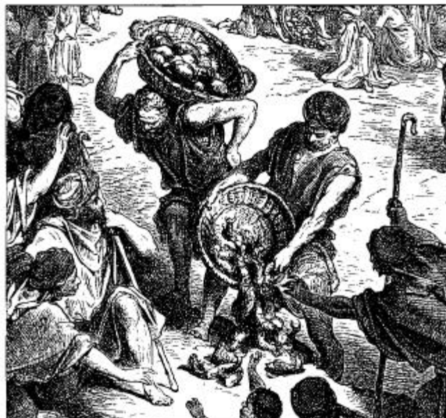
Feeding the Multitude near the Third Passover

The Sinaitic MS read η εορτη [the feast], while the Vatican 1209 and other Mss. omit the definite article η and