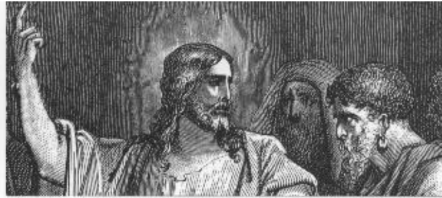
Christ in the Synagogue

"If therefore, all things are put under him [Jesus] with the exception of Him [God] who put them under him, he is the Lord of all and the Father is Lord of him ... And this indeed is said by Christ himself, as when in the Gospel he confessed Him to be his Father and his Gpd. ... He [Jesus] did not say, 'I and the Father am one,' but 'are one.' For the word 'are' is not said of one person, but refers to two persons and one power. He has himself made this clear when he spoke to his Father concerning his disciples [in John 17:22-23] ... For Christ had spoken of himself and showed himself among all to be as the Son ... And as the author and fellow-counsellor and framer of the things that are in formation He begat the Word ... He sent him forth to the world as Lord ... And thus, there appeared another beside himself ... For there is but one power, which is from the All; and the Father is the All, from whom comes this power, the Word ... and was manifested as the Son of God. All things, then, are by Him and He alone is the Father." ( Against The Heresy Of One Noetus, chapters 6, 7, 10, 11 )