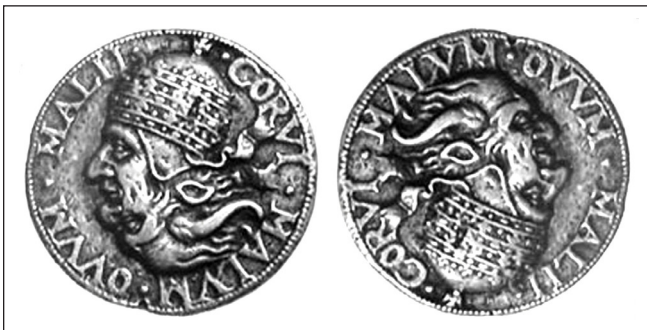
Coins such as this aroused public sentiment against the Pope. The image of a devil emerges when the coin is inverted. The Latin phrase translates as, “From a bad crow, a bad egg.”

“In December 795 Leo III notified Charlemagne of his election as pope, a favor normally reserved for the Byzantine emperor. Nonetheless, contingency rather than systematic planning characterized the next five years leading to Charlemagne’s coronation.