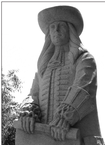
Statue of William Penn

The death of Sir William Penn in 1670 left young Penn in control of the family fortune, including a massive debt owed to his father by the crown. With this financial support, Penn now had the means to pursue his pilgrim ministry nearly full time. He traveled throughout England, Ireland, and along the Rhine River preaching the Quaker doctrine. Recognizing that the crown could never remit the growing debt to his late father, he asked for a colony in payment. His focus on this “holy experiment” of