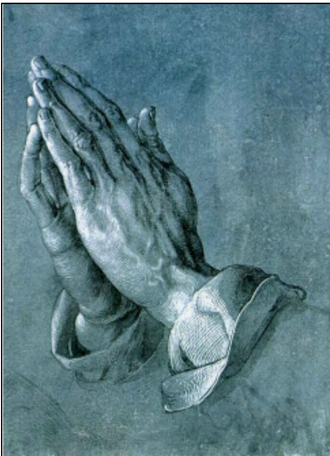
Praying Hands, Albrecht Dürer