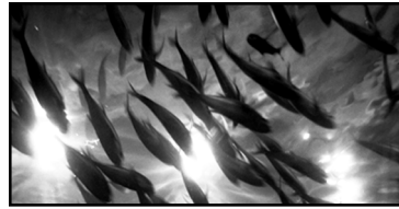
153 Great Fishes

Ponder this, 153 = 1 + 2 + 3 + 4 + 5 + 6 + 7 + 8 + 9 + 10 + 11 + 12 + 13 + 14 + 15 + 16 + 17 . In other words, it is equal to the sum of all the integers from 1 to 17. Seventeen was the age of Joseph when sold by his brothers. Joseph was a picture of Jesus. He was the perfect one (seven) who came to earth (10) to redeem us. Perhaps these 153 fish represent those redeemed from earth by Jesus during the first age of redemption.