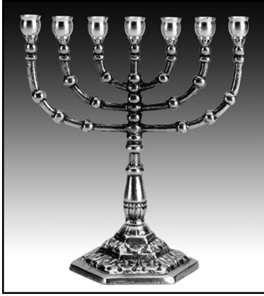
Lampstand from the Tabernacle

If we compare this arrangement to the symbolism of the vine and branches in John chapter 15, perhaps the center stem relates to Jesus in a particular way, the “vine” with branches. In this case Jesus is in the center. This would be compatible with the Jesus in the “midst” of the lampstands in Revelation.