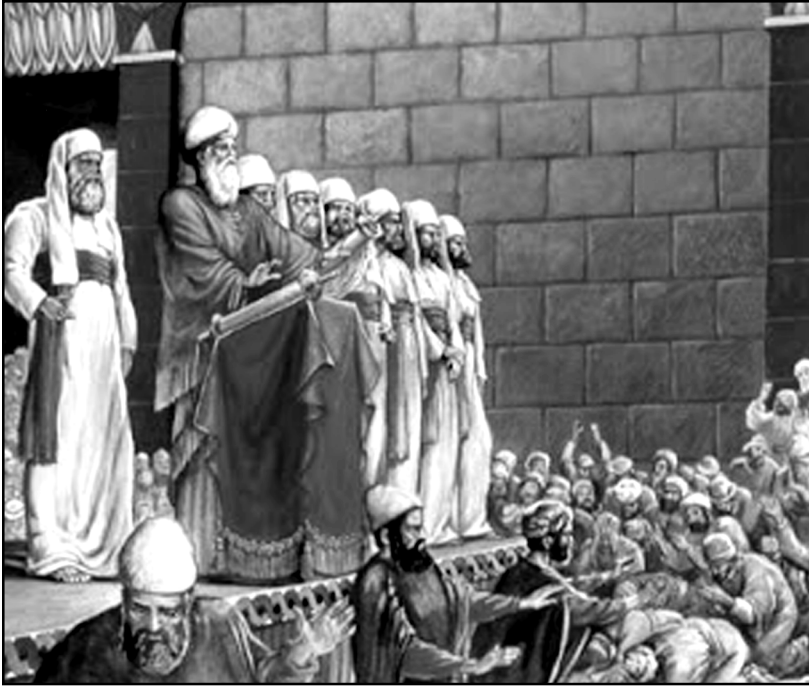
Ezra Reading the Law

in the first day of the month, shall ye have a sabbath, a memorial of blowing of trumpets, an holy convocation” (Leviticus 23:24). The trumpets announcing the opening of month seven connect in symbol to the seventh trumpet of Revelation, which sounded at the opening of the harvest — when the harvest messenger was still among us.