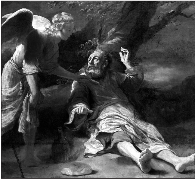
Elijah, fed a second time after sleeping

provided this first feeding represents a specific agent that “nourished” the church concerning Daniel’s prophecies of the end times, perhaps William Miller is the fulfillment.