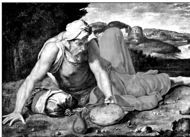
Elijah, fed on his way to Mount Horeb

and subsequently a great rain ensued. These events pictured the experiences closing the 1260 years of Papal authority. Papacy was put under strictures and taxes by the French government, the rebellious Pope was laid in arms, he died as a prisoner in France in 1799, and Napoleon refused to allow the election of a successor. The Protestant ethic flourished, Bible societies sprang up, Bibles in common languages were distributed by the millions, and the rains of blessing and truth became prodigious. The “two witnesses” — the Old and New Testaments — symbolically came to life again and ascended to great prominence in the ecclesiastical heavens (Revelation 11:11, 12).