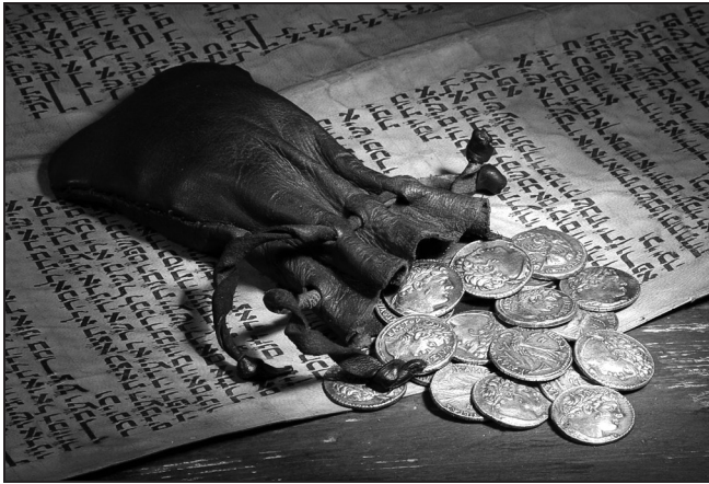
Thirty Pieces of Silver

With the context of Zechariah in mind, let us read Zechariah 11:12,13 (NAS). Verse 12 begins with the prophet Zechariah speaking to the leaders of Jerusalem. Notice the parallels to Jesus here. “And I said unto them, If it is good in your sight, give me my wages; but if not, never mind! So they weighed out 30 shekels of silver as my wages. Then the Lord said to me, Throw it to the potter, that magnificent price at which I was valued by them. So I took the 30 shekels of silver and threw them to the potter in the house of the Lord.”