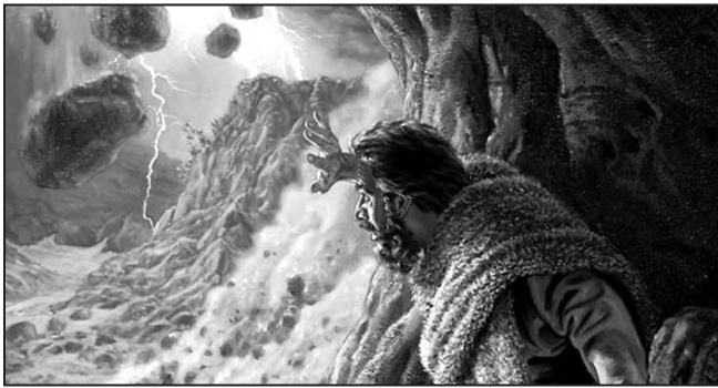
Elijah’s vision of the Time of Trouble

(c) Not long after 1989 the focus of difficulties became the Arab countries where Islam is widespread. The first Gulf War began the following year with Iraq’s invasion of Kuwait, The attack on New York by Al Qaeda followed in 2001, and the second Gulf War began two years later. Terrorism and turmoil have continued ever since then. Evidently this stage of trouble will continue until the close of the harvest. 4 5