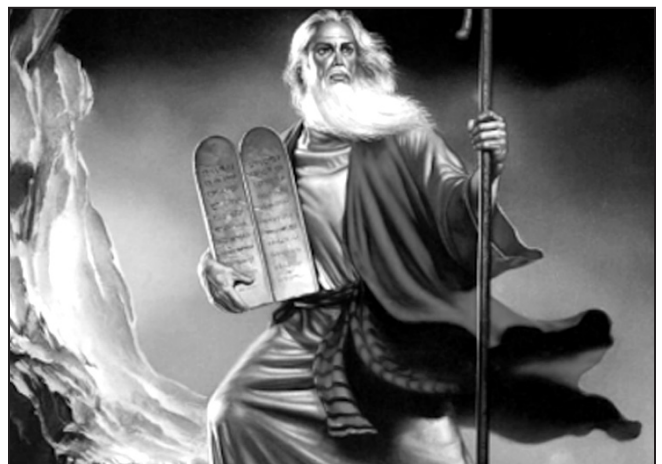
God Gave his name, Jehovah, to Moses at Mount Sinai