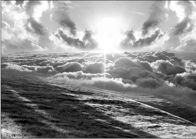
Spiritually, there will be a New Heavens and a New Earth.

shall be no more heard in her, nor the voice of crying. There shall be no more thence an infant of days, nor an old man that hath not filled his days: for the child shall die an hundred years old; but the sinner being an hundred years old shall be accursed” (Isaiah 65:19-20).