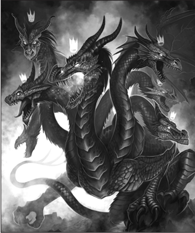
A dragon with seven heads and ten horns

the society that supported the Catholic Church, including the monarchies, civil governments, and the culture in general, that is, Christendom. Furthermore, Revelation 19 separates the two when, in its beginning, the Catholic Church is obviously spoken of as destroyed before the beast's destruction at the end of the chapter. Consider, also, that the little horn (Papal dynasty) rose out of the beast; 10 thus the beast supplied incubation and support for the Papacy and Catholic Church.