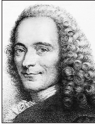
Voltaire, the French spokesman for "Enlightenment"

The dragon's destruction is distinct from that of the beast and false prophet in Revelation 20:1-3. The angel (Jesus) comes down from heaven (the apokalupsis or full revealing of Christ to the world) and personally ends the dragon's influence upon mankind. 30 This suggests the chameleon-like ability of the dragon who has survived the societal turmoil that brought down the beast, false prophet, and kings of the earth, to continue to deceive mankind. This is stopped by the direct intervention of Christ. That is the last we hear from the dragon, because Satan's political power will cease to exist at this point.