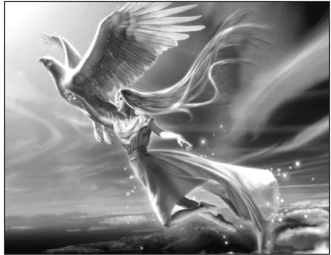
Woman fleeing as with two wings of a great eagle

We know from the last verse of Revelation 12 that the dragon would continue its activity beyond 1799, marking the end of the 1260 years and the French Revolution. The dragon now focusses its attack upon the righteous seed of the woman, rather than the unrighteous seed, the Man of Sin. Since the 1260 years period was distinctly described as being a period in which physical persecution of the saints would be allowed, we can conclude that such direct persecution would cease, to a large degree, after 1799. 26 This is well supported by the last 200 years’ history. Therefore, the dragon’s persecution could be viewed as an undermining of their values, an ever-increasing process of marginalization and eventual demonization of their beliefs and activities. This, in fact, we can see happening today, using the same process the devil used to “enlighten” the masses of 18th century France, the same process he used as “an angel of light” to create the great Apostate Church. Satan is not limited by light, but easily distorts it, “muddies the waters” with regard to his own objectives. 27