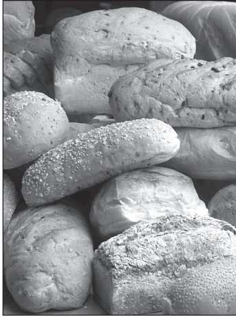
Meal offerings accompanied sacrifice.

These four types of bread correspond to four items for which our thanksgiving to God must be made: