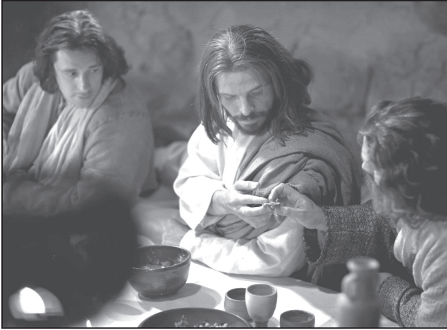
Jesus at the Last Supper

The verse then concludes: “Prepare it there.” Jesus is telling us that that is where the final acts of the old age would end so that the blessings for the disciples could really begin.