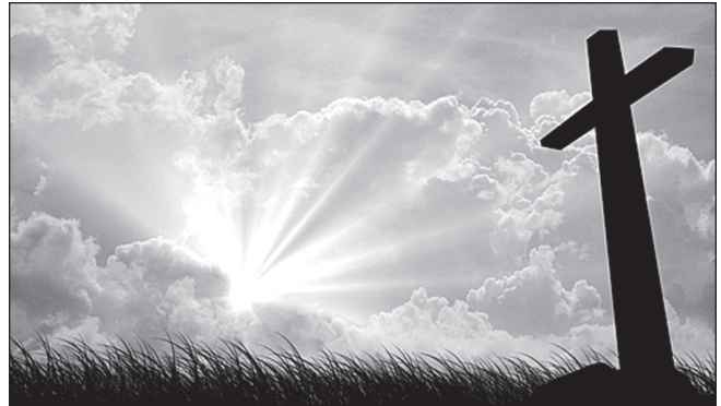
We should be living sacrifices, as Jesus was.

(2) There is a second way in which the gathering of the saints to Jesus occurs: the gathering of the saints beyond the veil to their heavenly home. “This we say unto you by the word of the Lord, that we which are alive and remain unto the coming [ parousia , presence] of the Lord shall not