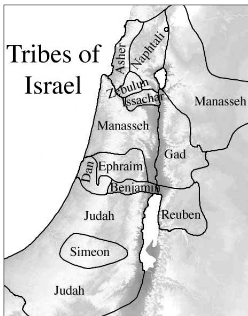
Reuben, Gad, Manasseh

While these three classes will have entered into their reward, their rest, they are not relieved of responsibility to help others. The others in this case make up the world of mankind. These special classes will all assist mankind in “conquering the land,” an apt illustration of