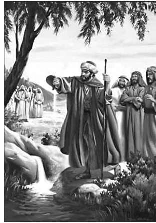
Elisha, healing the waters

When Elisha cast salt into the polluted water he did something that would not normally cleanse it. Thus this was clearly a miracle. Antotypically, what the Ancient Worthies will do in Israel will be miraculous.