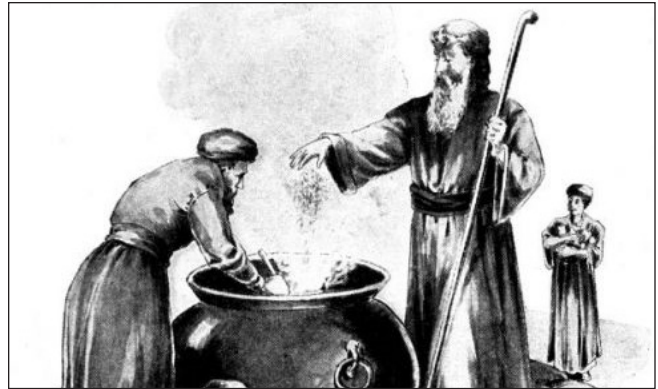
Elisha cleanses the poisonous pottage

The tiny seeds of the gourd remind us of Jesus' description of the tiny mustard seed that grows into a giant tree so birds can lodge in its branches (Matthew 13:31). This tree is often connected to Revelation 18:2 where Babylon became a habitation of every unclean and hateful bird. Planting the seeds of error at the beginning