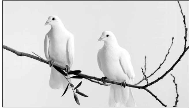
If we are not peacemakers, then are we blessed?

“A soft answer turneth away wrath: but grievous words stir up anger. The tongue of the wise useth knowledge aright: but the mouth of fools poureth out foolishness. A wholesome tongue is a tree of life: but perverseness therein is a breach in the spirit” (Proverbs 15:1,2,4).