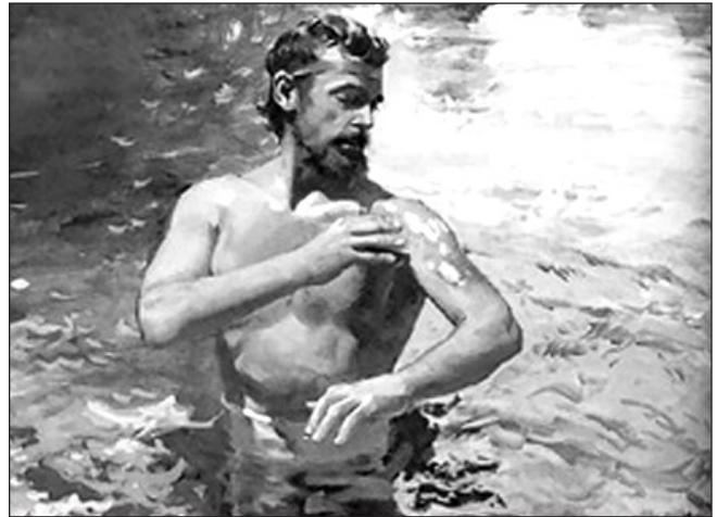
Naaman in the Jordan River, being cleansed of leprosy

not be for sale — all kingdom work and miracles will be to the glory of God and the blessing of mankind. Gehazi lied to Elisha when asked where he had gone, but Elisha knew. No one will be able to hide their misdeeds and appropriate punishments will be meted out for transgressors. • Step 9 — Gehazi Smitten with Leprosy = Greed not tolerated.