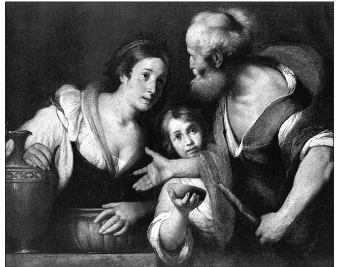
The widow’s cruse of oil did not fail.

Elisha told her to borrow as many pots as she could. Miraculously, she filled them all from the one pot of oil. Elisha directed her to sell the oil and pay her debt. The remaining oil provided further support for her family.