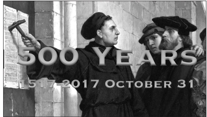
“Here I stand, I can do no other, God help me, Amen.”

Anabaptists were wide-ranging in doctrine, but three issues characterized them. They took exception to church-state union, considering it whoredom. They broke with Luther and Ulrich Zwingli on infant baptism. For Anabaptists, baptism was for those who had: “Received Jesus Christ and wished to have him for Lord, King and Bridegroom, and bind themselves also publicly to him, and in truth submit themselves to him and betroth themselves to him through the covenant of baptism and also give themselves over to him dead and crucified and hence to be at all times subject, in utter zeal, to his will and pleasure” ( The Ordinance of God , Melchior Hofmann, 1530).