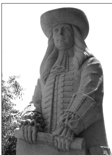
Statue of William Penn

The death of Sir William Penn in 1670 left young Penn in control of the family fortune, including a massive debt owed to his father by the crown. With this financial support, Penn now had the means to pursue his pilgrim ministry nearly full time. He traveled throughout England, Ireland, and along the Rhine River preaching the Quaker doctrine. Recognizing that the crown could never remit the growing debt to his late father, he asked for a colony in payment. His focus on this “holy experiment” of