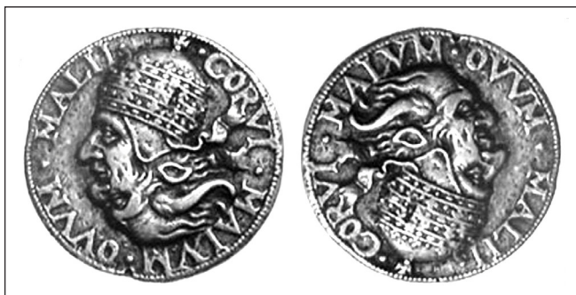
Coins such as this aroused public sentiment against the Pope. The image of a devil emerges when the coin is inverted. The Latin phrase translates as, “From a bad crow, a bad egg.”

“In December 795 Leo III notified Charlemagne of his election as pope, a favor normally reserved for the Byzantine emperor. Nonetheless, contingency rather than systematic planning characterized the next five years leading to Charlemagne’s coronation.