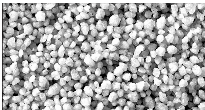
Possible appearance of manna

The nation of Israel in its journey to the promised land typically represents spiritual Israelites in their journey to the heavenly kingdom. The experiences of the nation thus depicted experiences that spiritual Israelites might expect in their journey. As the natural Israelite left Egypt and went into the wilderness, there to have his needs sustained by God, so spiritual Israelites have left the