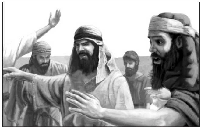
Grumbling in the wilderness

Their murmuring provides us with insight into the psychology of fallen human nature. In their cry against Moses they said, “would to God we had died by the hand of Jehovah in the land of Egypt, when we sat by the fleshpots, and when we did eat bread to the full.” They had