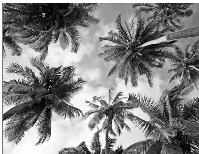
At Elim there were 12 wells and 70 palms.