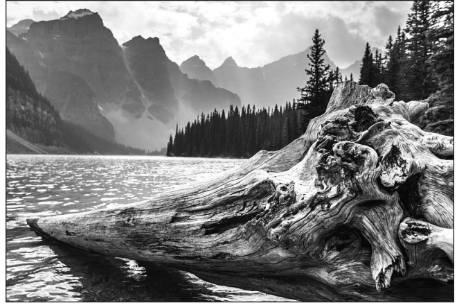
Bitter waters of Law are sweetened with the wood of the Cross.

So the curse or poison of the old covenant was removed by our Lord's sacrifice. The poison is the sinful inheritance of mankind which, under the new law covenant with its better mediator, the Christ, will completely heal. The Christ will make good on all the gracious promises of God to those who will walk in the ways of the Lord.