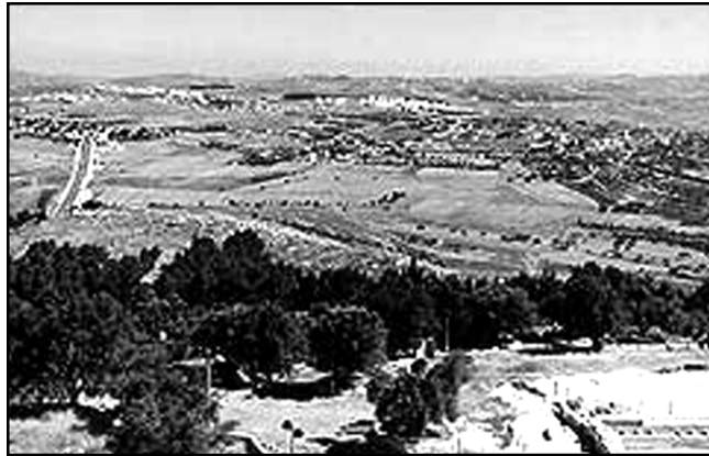
The place of Gibeon

Joshua, through Jehovah, is passing judgment on the gods of the Amorites. The Hebrews had a similar experience when they came out of Egypt with respect to the Egyptian gods. As each plague presented itself, Egyptian gods and goddesses were exposed as powerless in the presence of Jehovah. As judgment came on the gods of Egypt, so judgment came on the gods of the Amorites (Exodus 12:12, Numbers 33:3, 4, Exodus 18:11).