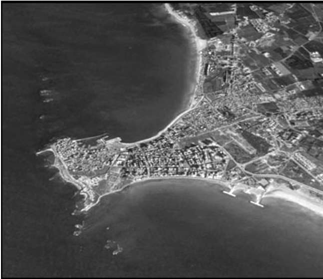
Modern image of Tyre

to implant a separate consciousness in peoples of so small a caliber that they were incapable not only of forming Great Powers but even of forming minor states possessed of full political, economic, and cultural independence.”