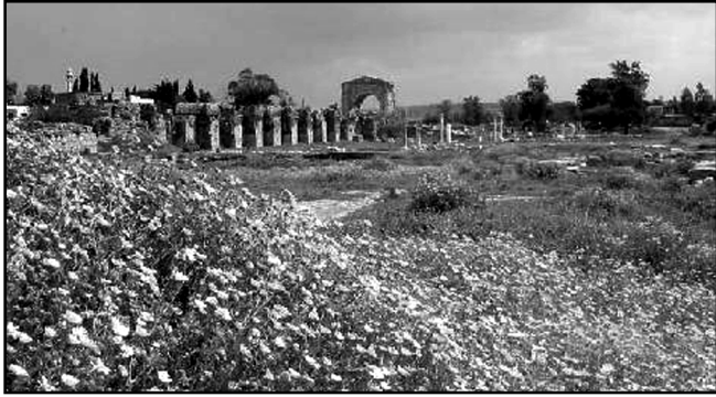
Spring blossoms in Tyre

ment on changes to the regulation of the global financial system, a senior U.K. Treasury official said ... These include setting up global “colleges of supervisors” to monitor international banks, expanding the membership and mandate of the Financial Stability Forum and reforming the International Monetary Fund to increase developing countries’ representation on its executive board ... French President Nicolas Sarkozy has called on leaders to use the reforms for “re-founding capitalism.”