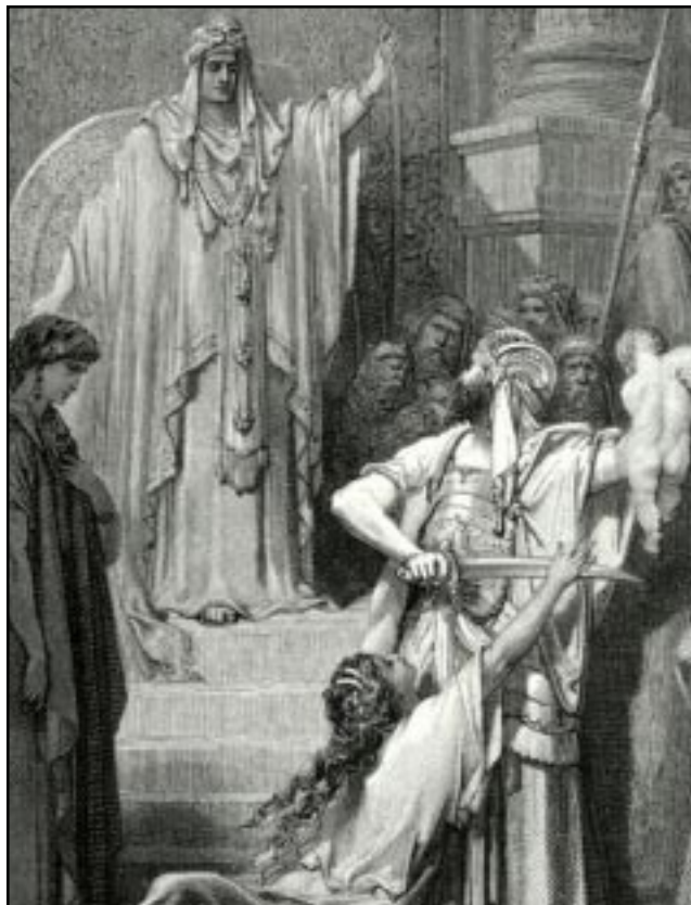
The Wisdom of Solomon

It is in the third autobiography of Solomon, however, where we see the biography of his heart. Ecclesiastes is a deeply introspective book. Written in his old age, when his sight was