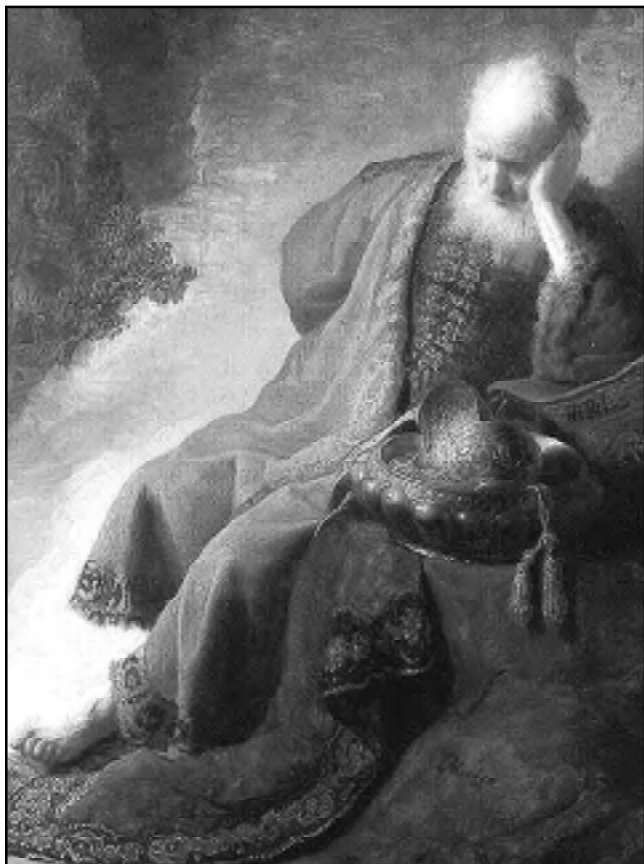
The Prophet Jeremiah

The next parable of the earthen vessels, that of the potter and the clay, is in Jeremiah 18:1-10. Jeremiah is first directed to learn a lesson as he watched the potter at his wheel. Pottery making was a familiar industry throughout the Near East and one that Jeremiah had witnessed many times. What impressed Jeremiah the most was the absolute dominance of the potter over his clay. He also marveled at his creative skills. After watching the potter Jeremiah went on to indicate that the nation of Judah, notwithstanding its boastful strength, was as fragile as the clay. They were as subject to the will of God as was the clay to the potter’s will. In the parable, somewhere in the potter’s operation the vessel became marred, out of shape. When this happened the potter took the vessel and kneaded the clay once again, for it was still soft, not