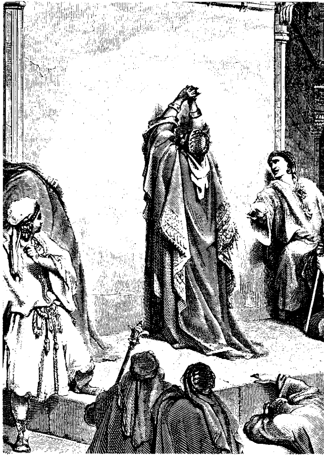
David Mourning the Death of Absalom

Nathan was a common Hebrew name (meaning gift) and Nathan the prophet may or may not have been the father of another of David's top soldiers, Igal (2 Samuel 23:36), and brother of a later captain of David's forces, Joel (I Chronicles 11:38); or he may have been the father of two of Solomon's chieftains, Azariah and Zabud (1 Kings 4:5), though it is more likely that these would have been children of Solomon's brother Nathan.