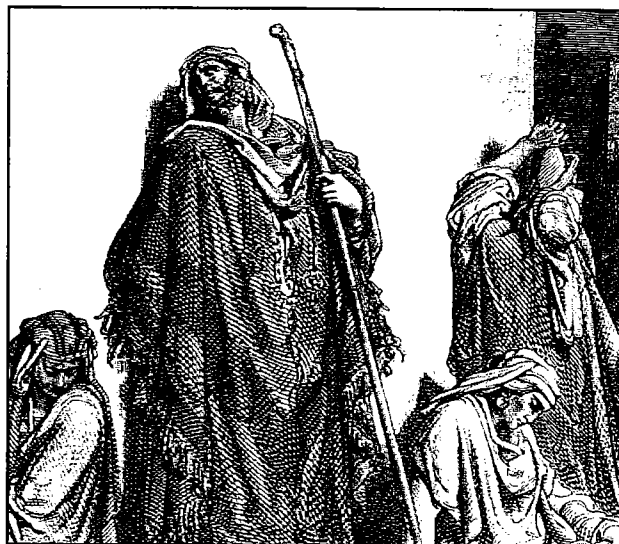
Mourning the Ruins of Jerusalem