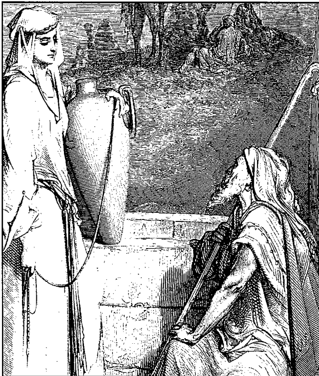
Eliezer and Rebekah. "I will go!"

Continuing in Leviticus 8, the life-giving organs and fat are burned, showing our best powers — human energy. The hide and dung are burned outside the camp showing how the world sees this consecration, as a waste of time. The world cannot see these things. They cannot see what is in the Holy; they cannot see God's plan, for God has not revealed it to them. God is not dealing with them yet. Their time is future. The world thinks we are fools for Christ's sake.