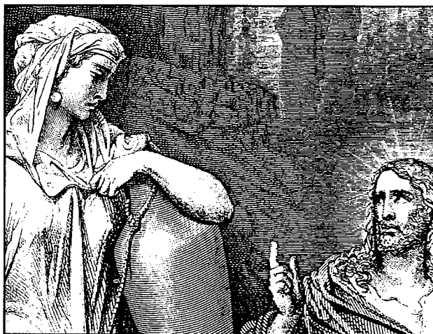
How do we respond?

Jesus spoke of this in Matthew 13:9 and 15: Who hath ears to hear, let him hear.” Notice he was not speaking to everybody even though he talked to thousands. Although many listened, only few were able to understand. For this people's heart is waxed gross (calloused), and their ears are dull of hearing, and their eyes they have closed; lest at any time they should see with their eyes and hear with their ears, and should understand with their heart.” Your heart is a picture of your desires — what you truly want. This is why we say, “Where your treasure is, there will your heart be also.” But to those with the hearing ears is the promise in Matthew 13:16-17: “But blessed are your eyes, for they see: and your ears, for they hear. For verily I say unto you, That many prophets and righteous men have desired to see those things which ye see, and have not seen them; and to hear those things which ye hear, and have not heard them.”