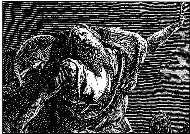
The Lamentations of Jeremiah

Without fully realizing its significance for the return of favor, many Jewish commentators observe that there is one